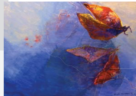
Day in May by Elise Newman, 2007

October 18, 2008 is the last day to visit the Ohio Arts Council's Riffe Gallery exhibition Midwestern Visions of Impressionism: 1890 – 1930 . This show takes a fresh look at the American Impressionism movement through the paintings of 31 artists born or raised in the Midwest and working between 1890 and 1930.