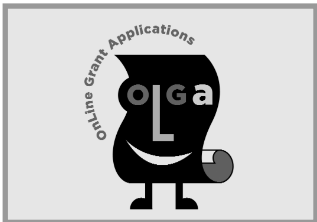
OnLine Grant Applications

This fall the Ohio Arts Council will introduce the newest member of its team—OLGA (OnLine Grant Applications). OLGA is the OAC's new web-based funding application system that will be launched in early November 2004. A series of regional meetings around the state in October will introduce OLGA, provide training on how to use the new system and present the new OAC Guidelines and program areas that will accompany OLGA.