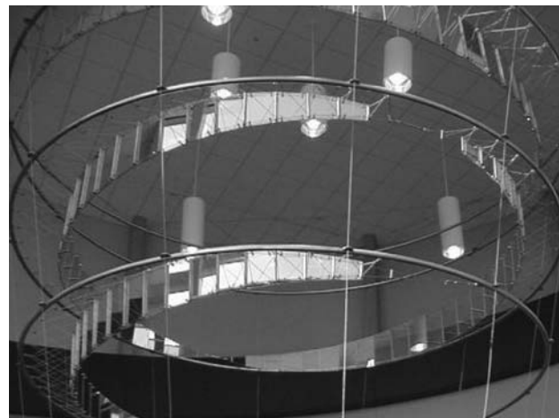
Ray King, Owens Rings (detail), Owens Community College, Toledo

Students, faculty and visitors will be treated to an ever-changing light show in the entryway of the brand new Center for Fine and Performing Arts at Owens Community College (OCC) in Toledo. OCC recently unveiled a magnificent piece of public art that creates a dramatic entrance to the state of the art facility. The sculpture, entitled Owens Rings , consists of a series of six tapered metal rings encircling rings of rectangular colored glass designed to reflect the abundant sunlight in the glass-walled rotunda. As the angle and intensity of the sun's rays change throughout the day, so do the reflections from the glass.