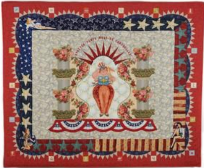
Barbara Lind , Stretch Pants Must Be Controlled , 2010