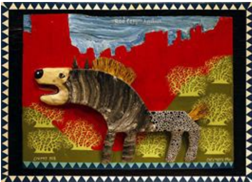
Levent Isik, Red Canyon Appaloosa , c.1990s